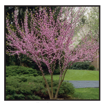
Eastern Redbud: 25' mature height, deciduous, partial shade to full sun, rosy pink spring blooms, green leaves. Planting size 6' to 7'.