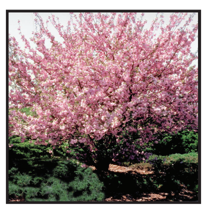
Kwanzan Cherry: 15' to 25' mature height, deciduous, full sun, pink spring blooms, green leaves. Planting size 6' to 7'.