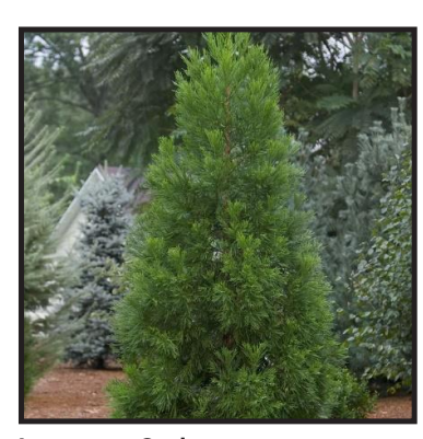
Japanese Cedar: 40' mature height (medium zone tree), evergreen, full sun. Planting size 4' to 5'.