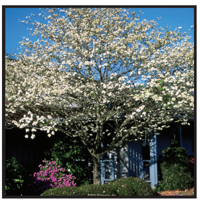
White Dogwood: 25' mature height, deciduous, full shade to full sun, white spring blooms, green leaves. Planting size 6' to 7'.

If you have any questions or comments, please contact KUB Vegetation Management at 865–558–6658.