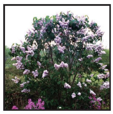
Fragrant Lilac*: 8' to 15' mature height, deciduous hardy shrub, partial shade to full sun, light purple spring flowers. Planting size 3 gallon.