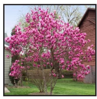
Jane Magnolia: 15' mature height (low zone tree), deciduous, full to partial sun, large, purple-pink, tulip-shaped flowers. Planting size 6' to 7'.