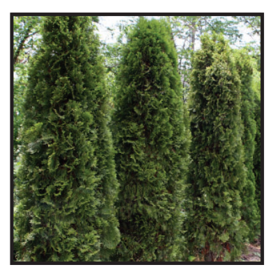
Emerald Green Arborvitae: 10' to 15' mature height, evergreen, full sun, shimmering emerald green foliage. Planting size 4' to 5'.