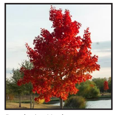
Brandywine Maple: 50' mature height (tall zone tree), deciduous shade tree, full sun, green leaves turning red into purple late season. Planting size 6' to 7'.