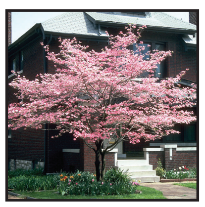
Pink Dogwood: 25' mature height, deciduous, full shade to full sun, pink spring blooms, green leaves. Planting size 6' to 7'.