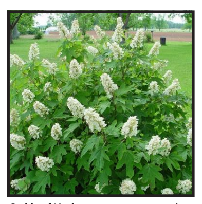
Oakleaf Hydrangea (white flowering)*: Deciduous. 6' tall and 6' wide, morning sun with afternoon shade. Large white blooms in late spring to summer. Great fall color of red, orange and burgundy into late fall. 3 gallon planting size.