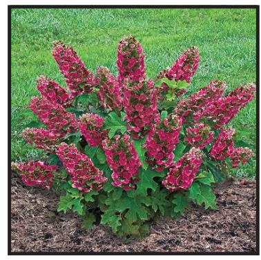
Oakleaf Hydrangea (red flowering)*: Deciduous. 5' tall and 5' wide, morning sun with afternoon shade. Large red blooms in late spring to summer. Great fall color of red, orange and burgundy into late fall. 3 gallon planting size.