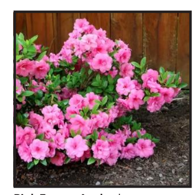
Pink Encore Azalea*: mature height 3' to 4', spread 3' to 4' wide. Morning and sun, afternoon shade. 3 gallon planting size.