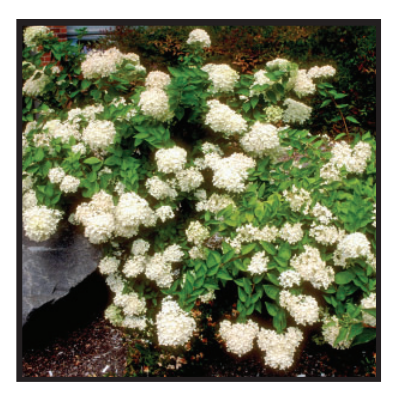
Pee Gee Hydrangea*: 10' to 20' mature height, deciduous shrub, partial shade to full sun, white summer flowers. Planting size 3 gallon.